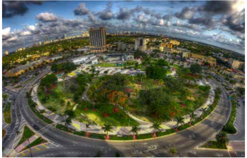
ArtsPark at Young Circle

The City hosts hundreds of programming hours with over 150 cultural programs including arts / dance, after-school, summer and adult learning programs, senior socials and so much more. There is always something to do here in the City of Hollywood's park system, so come out and play with us.